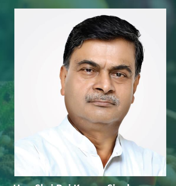
Hon Shri Raj Kumar Singh Minister of Power, New and Renewable Energy