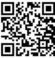
Uganda Solar Energy Association (USEA)