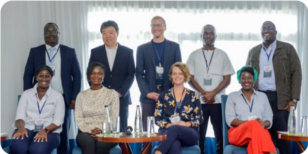
Partnerships with industry leaders and financiers