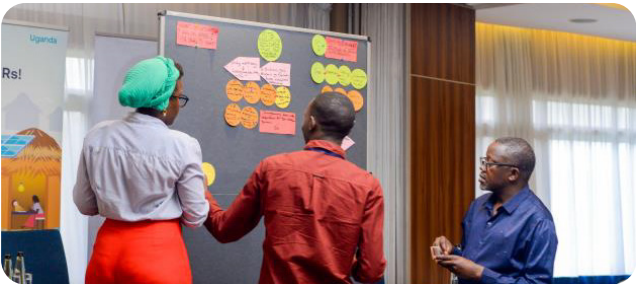
Innovative individual and cohort training approaches