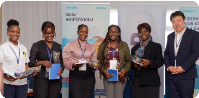
Focus on gender mainstreaming