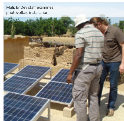
Mali: EnDev staff examines photovoltaic installation.