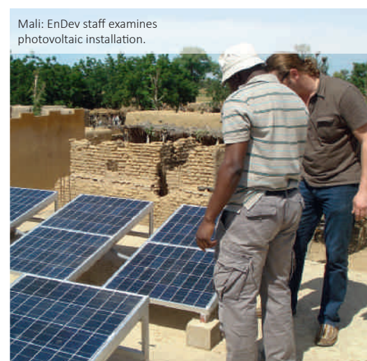
Mali: EnDev staff examines photovoltaic installation.