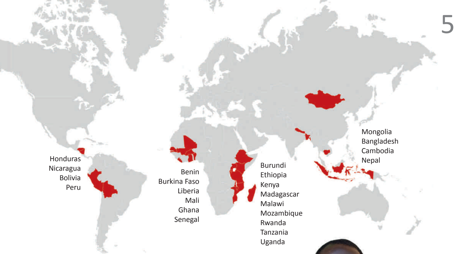
Number of households who gained access to modern energy services since 2005